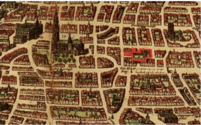
source: historical map of Antwerp by Braun and Hogenberg

Sapphire House Antwerp is situated in the lively heart of Antwerp. Ultimately central for fashionistas, art- and food lovers, with the Handelsbeurs on site. The city of Antwerp is situated on the Schelde River, about 55 miles (88 km) from the Belgian North Sea, and close to the Antwerp Harbour, which since the Middle Ages formed a crucial link in the world of trade.